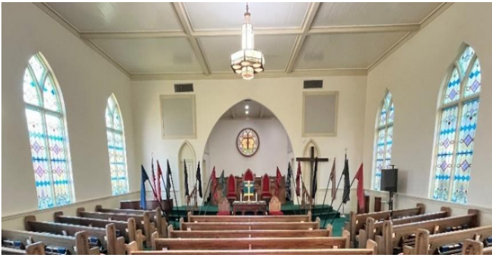
Kirkin "O the Tartans Service