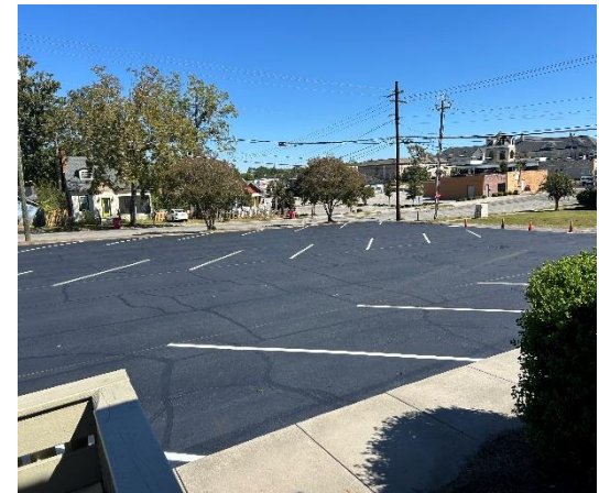
Re-surfaced parking lot